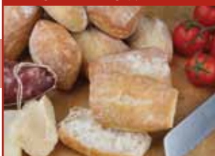
MINI CIABATTA ROLL