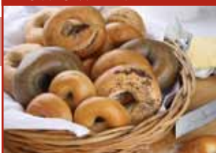
BAGEL BOILED MIXED