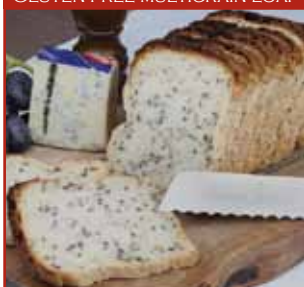
GLUTEN FREE MULTIGRAIN LOAF