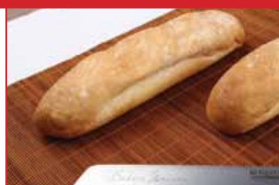
11120 Soft Half Baguette