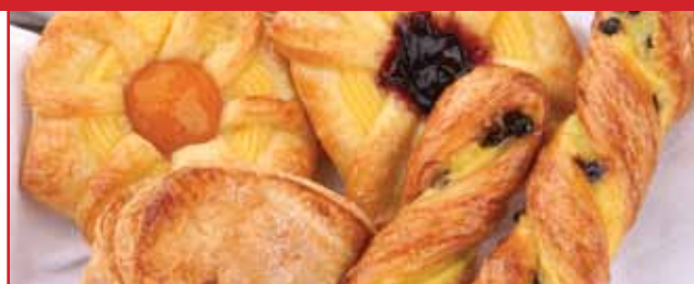
12714 Large Mixed Danish version 2