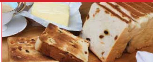
14914 Raisin Loaf Café Style

‘ 100% AUTHENTIC FRENCH STYLE BREADS AND PASTRIES ’