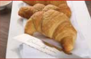
MEDIUM BUTTER CROISSANT FULLY BAKED