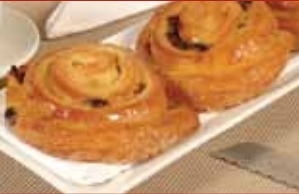
LARGE SULTANA SNAIL