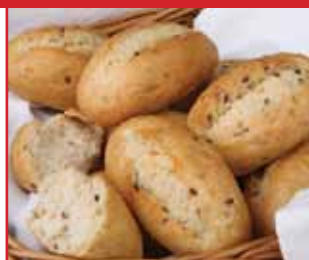
11419 Catering Roll Multigrain