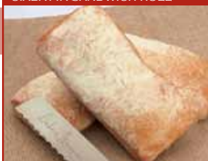
CIABATTA SANDWICH ROLL