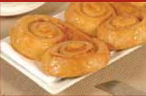
LARGE CINNAMON SCROLL