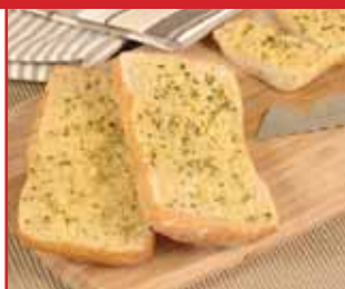
11814 Garlic Bread 7.5"