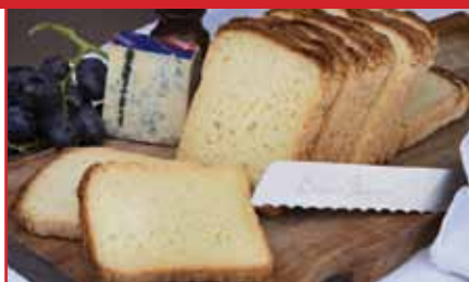
11816 Gluten Free White Loaf Pre sliced