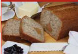
BANANA CARAMEL LOAF