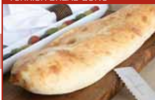
TURKISH BREAD LONG