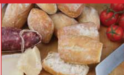
11493 Mini Ciabatta Roll