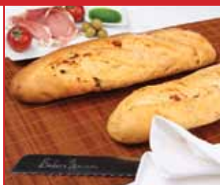
11214 Batard Sundried Tomato & Cheese