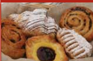
LARGE MIXED DANISH x 5