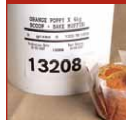
ORANGE &amp; POPPY SEED WET MIX