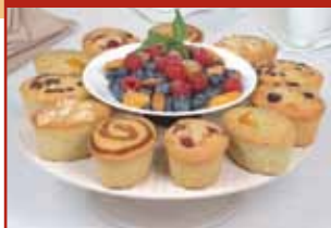
MEDIUM MIXED FRIENDS