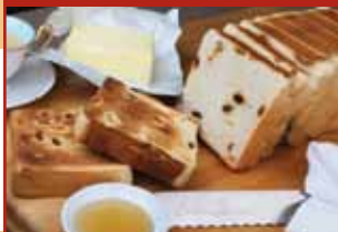
RAISIN LOAF CAFE STYLE