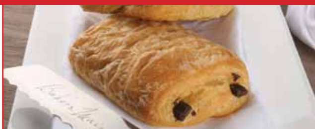
12607 Pain Au Chocolat