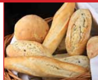
11417 Gourmet Mixed Rolls