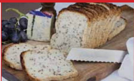
11817 Gluten Free Multigrain Loaf Pre sliced