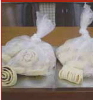
DANISHES BAGGED SEPARATELY

EACH TYPE OF DANISH IS NOW PACKED IN ONE INDIVIDUAL BAG (1 DANISH VARIETY PER BAG )