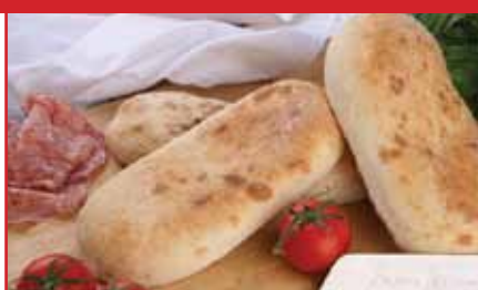
11815 Turkish Roll Oval