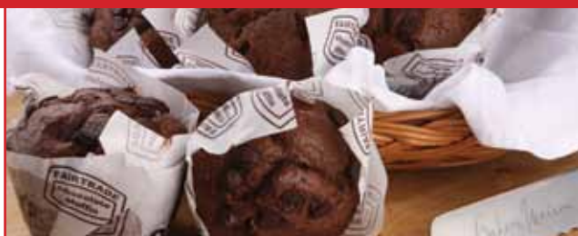
13219 Fair Trade Chocolate Muffin