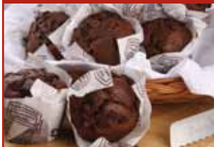
LARGE CHOCOLATE FAIRTRADE MUFFIN