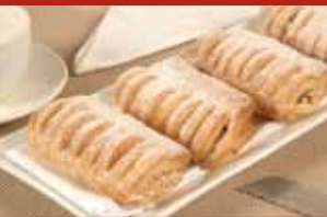
LARGE APPLE STRUDEL