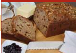
BANANA FRUIT &amp; NUT LOAF