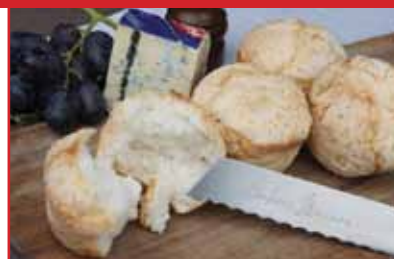
11818 Gluten Free White Bread Roll