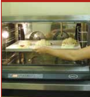
BAKE &amp; GET THE FRESHEST PASTRIES

THE NEW IMPROVED PACKAGING LAYOUT APPLIES TO THE FOLLOWING PRODUCTS: